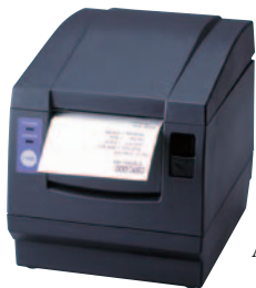
Available in black