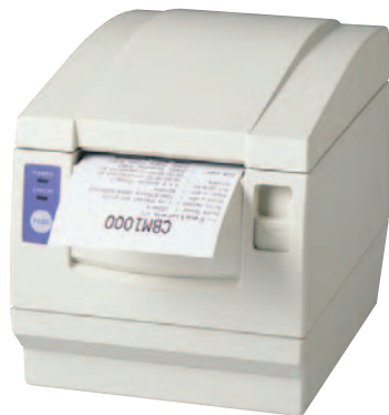
Standard version (Built-in AC adapter)